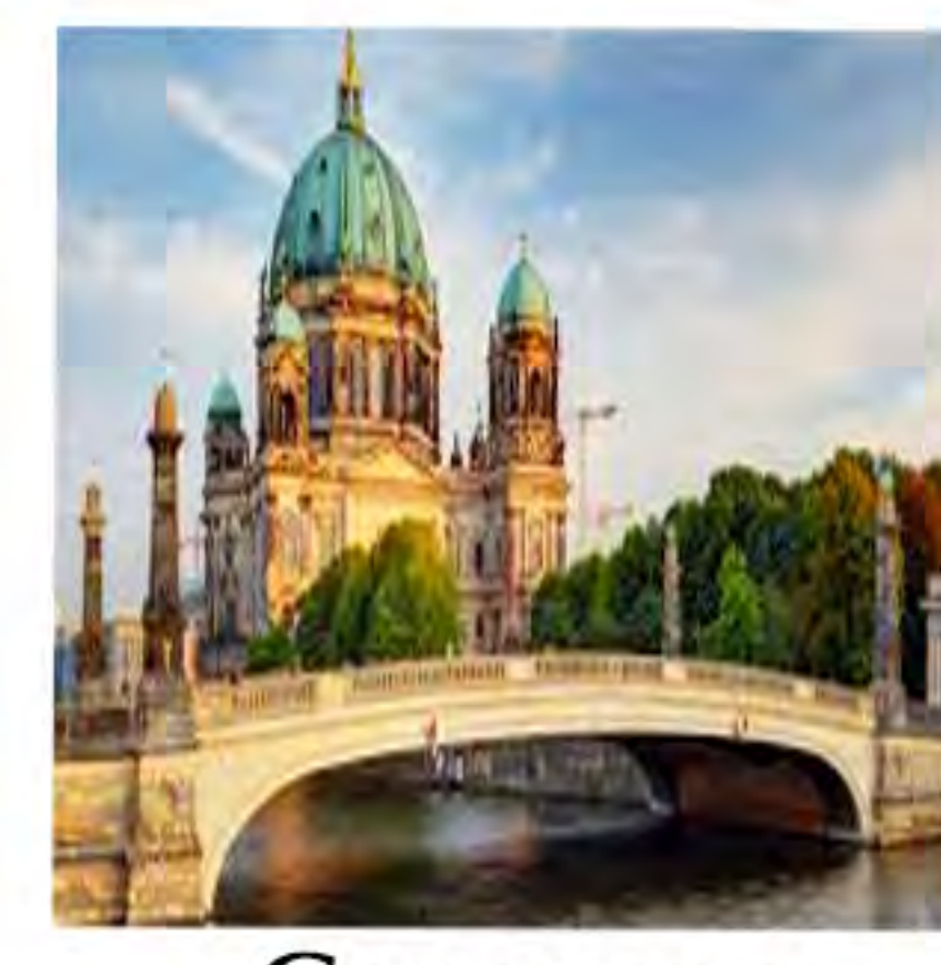
Germany: Berlin delivery 2nd quarter 2018 ULTRA HD 4K