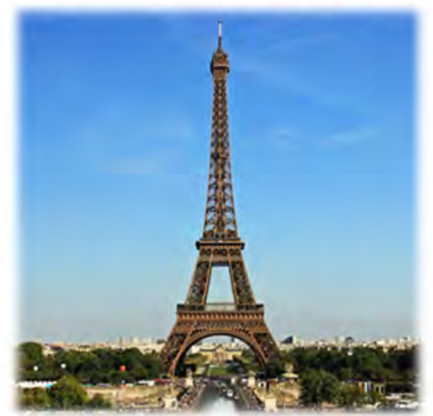
France: Paris delivery 4th quarter 2018