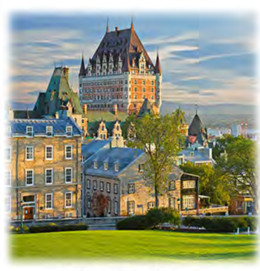
Canada: Montreal / Quebec delivery 2nd quarter 2018