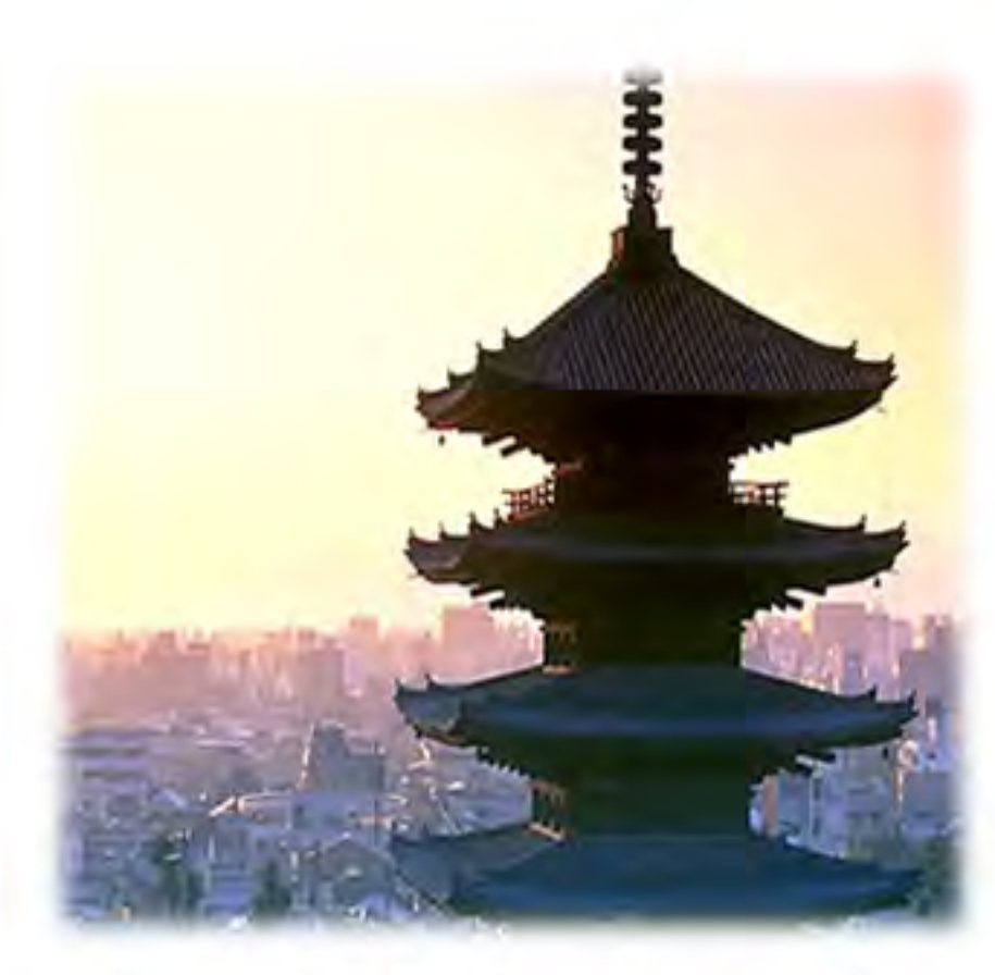
Japan: Kyoto/Nara ©2016