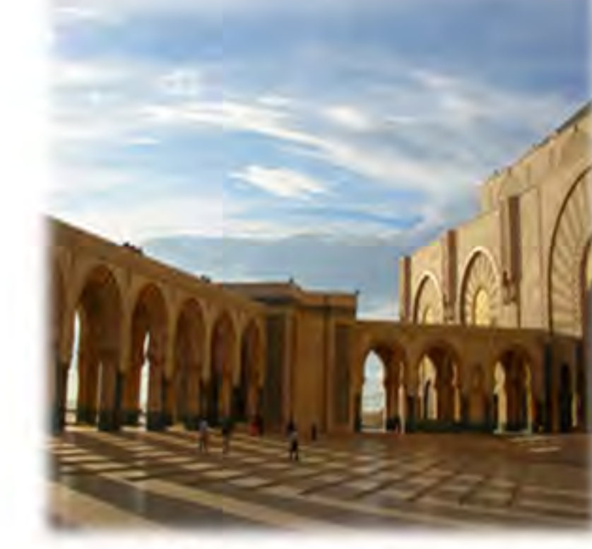
Morocco: Fez/Meknes/ Marrakech ©2015