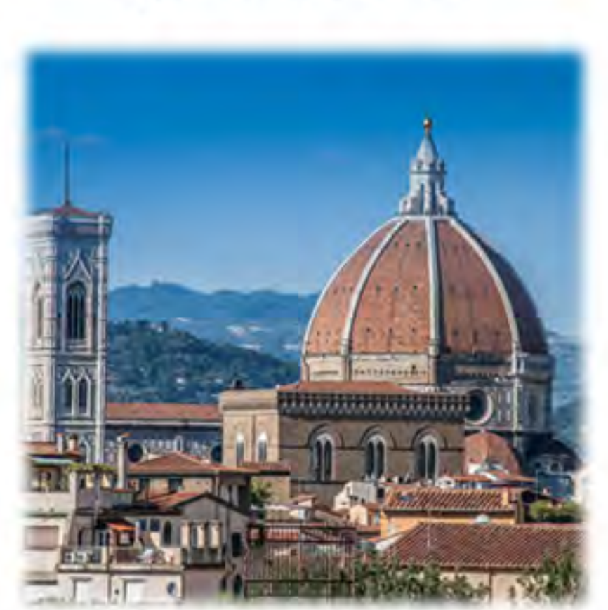
Italy: Florence / Siena delivery 2nd quarter 2018