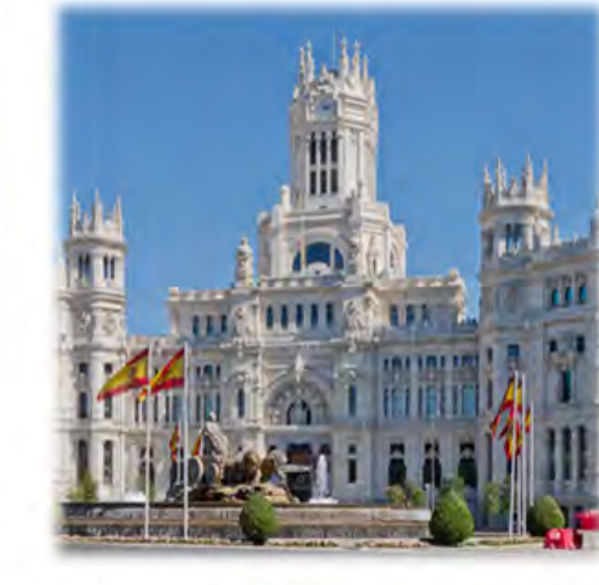
Spain: 2 documentaries • Madrid ©2016 • Seville ©2011