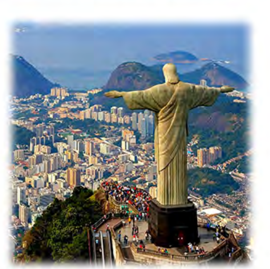
Brazil: Rio de Janeiro ©2017 New