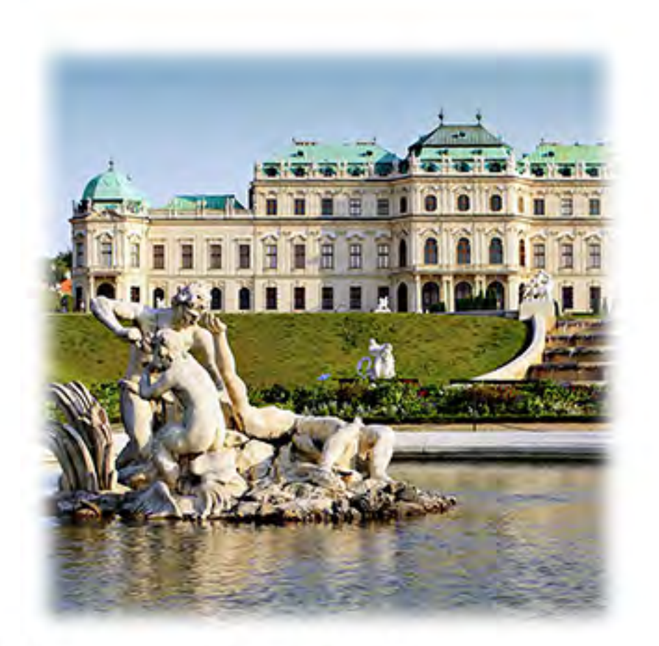
Austria: Vienna ©2018 New