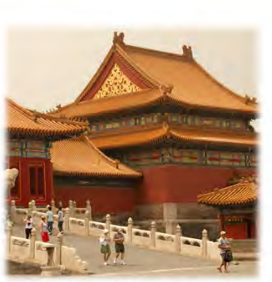
China: Beijing ©2016