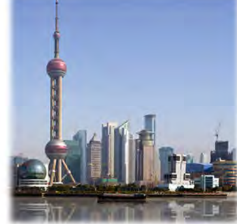
China: Hong Kong / Shanghai ©2015