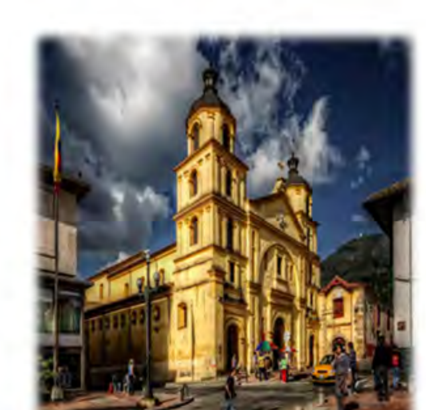
Columbia: Bogota/Cartagena ©2015