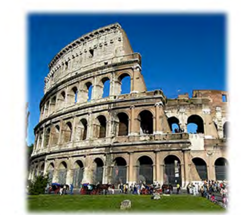
Italy: 2 documentaries •Rome ©2015 • Venice ©2015