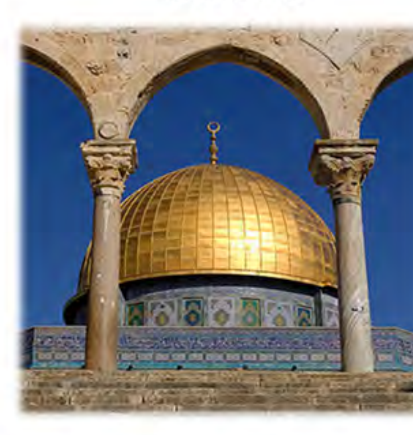
Israel: Jerusalem ©2011