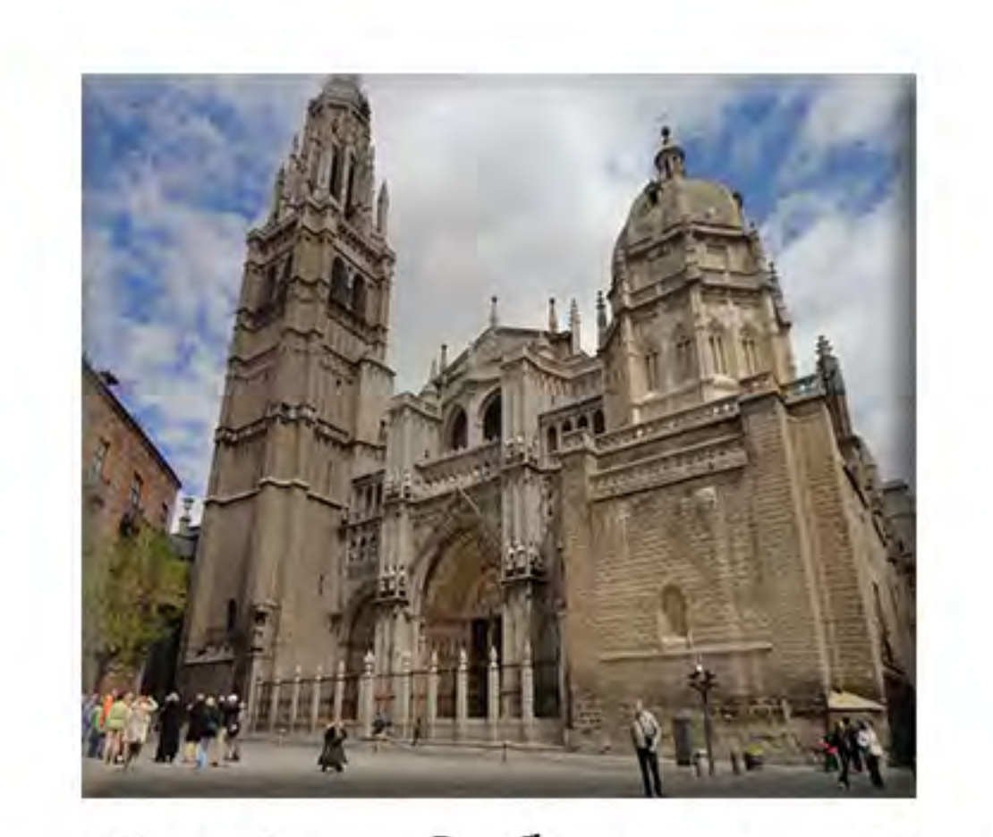
Spain: 3 documentaries . Toledo, Segovia, New · Salamanca New • Leon, Burgos©2018 New