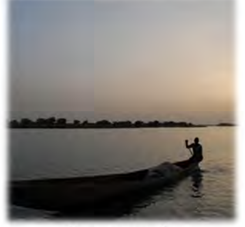
Senegal: Dakar ©2011