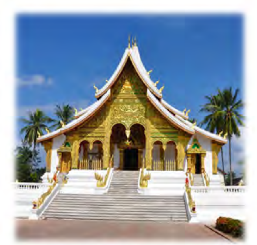
Laos: Vientiane / Luang Prabang ©2015