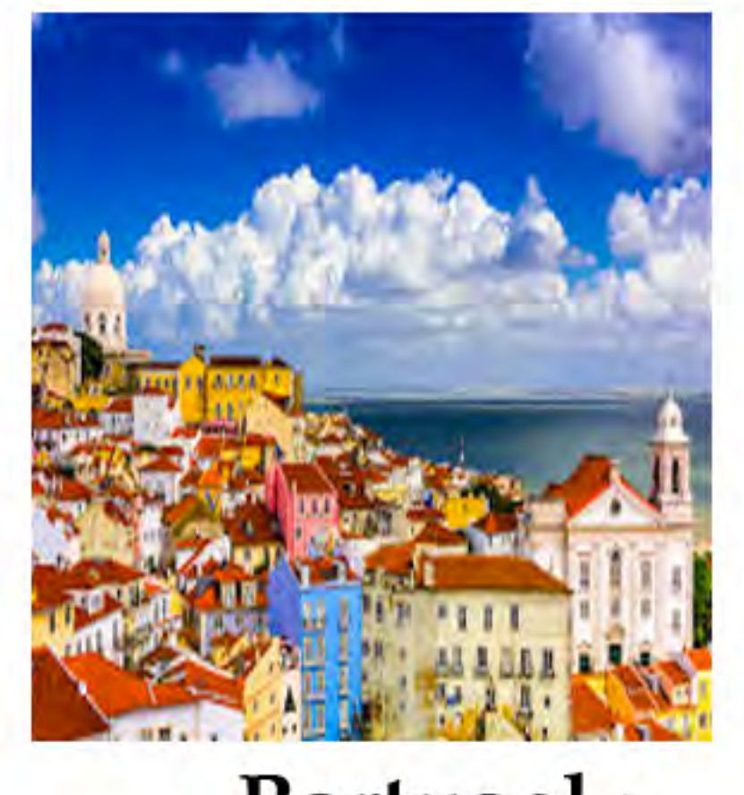
Portugal: Lisbon delivery 2nd quarter 2018