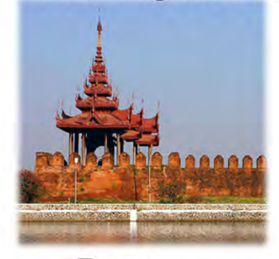
Burma: Mandalay/Rangoon ©2016