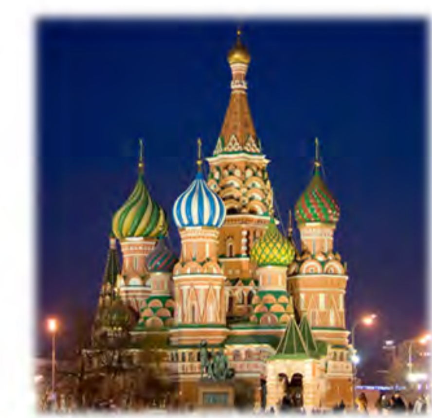
Russia: 2 documentaries Saint Petersburg ©2016 • Moscow ©2015