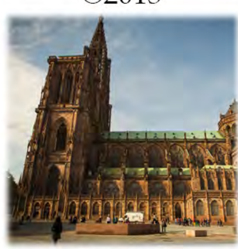
France: Mulhouse/ Strasbourg ©2011