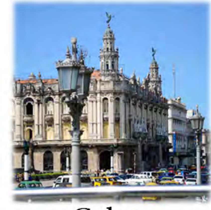
Cuba: Havana ©2015